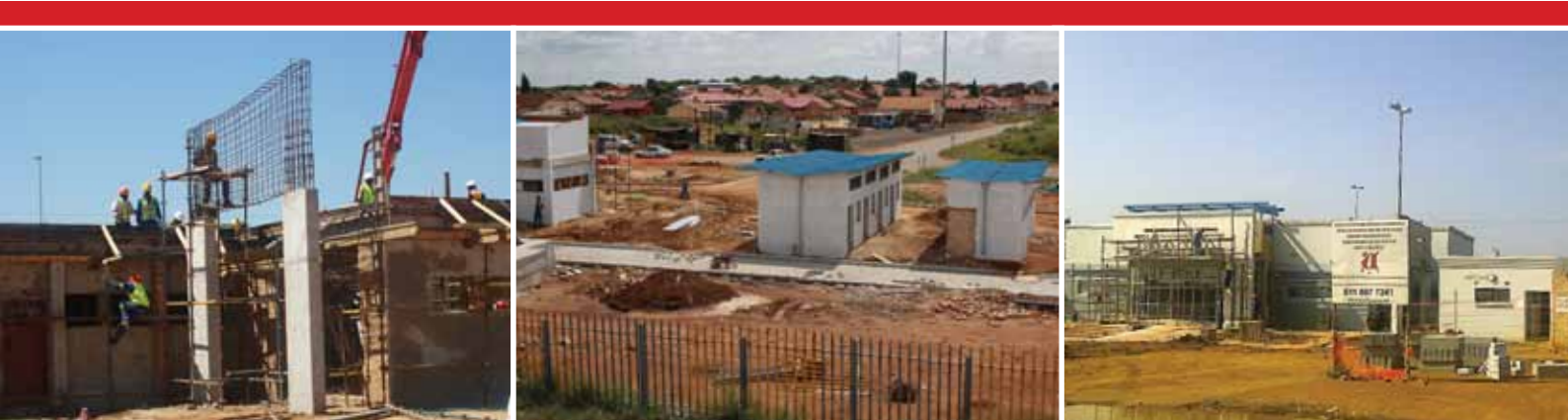
Kwaggastroom Railway Station