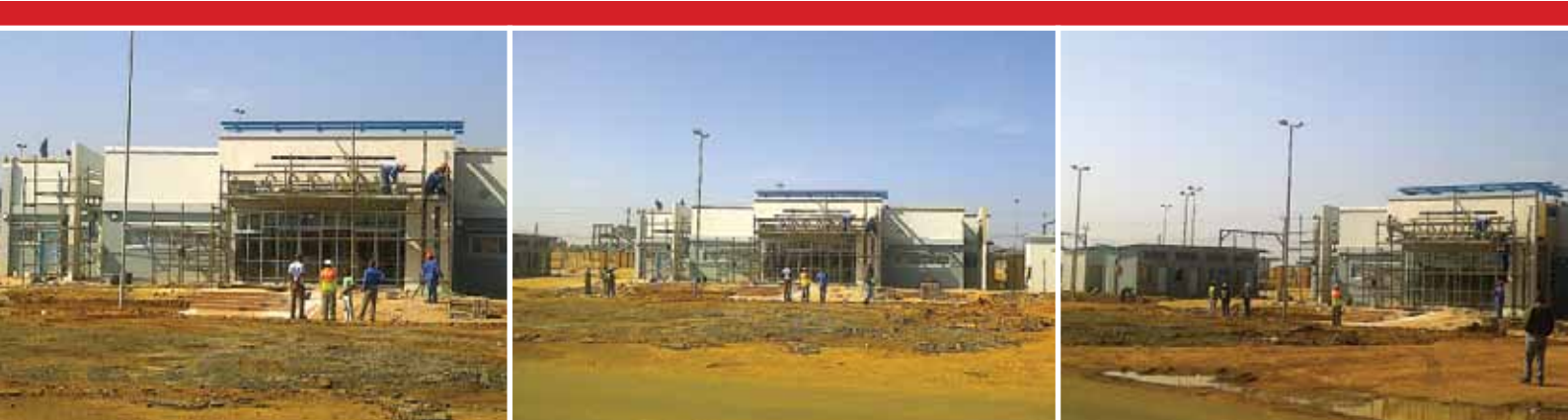
Kwaggastroom Railway Station